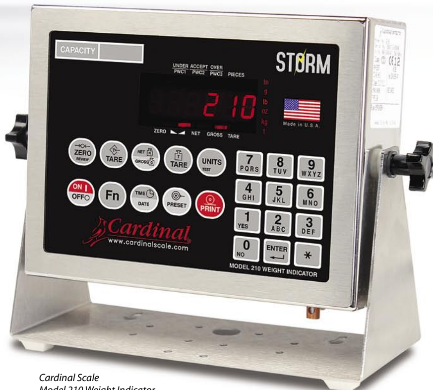
Cardinal Scale Model 210 Weight Indicator