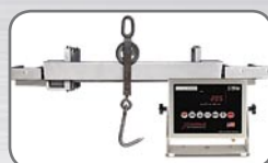
Overhead Track Scales